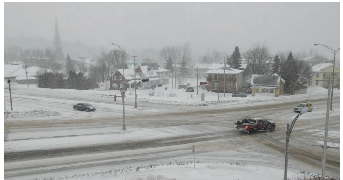
Saguenay, 2016