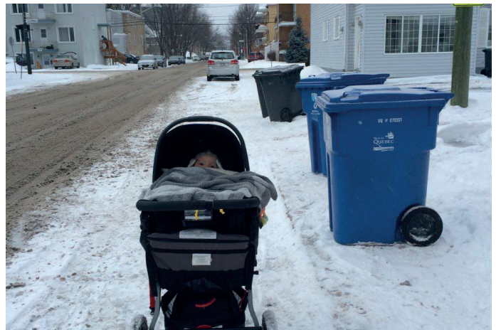
Québec, 2016