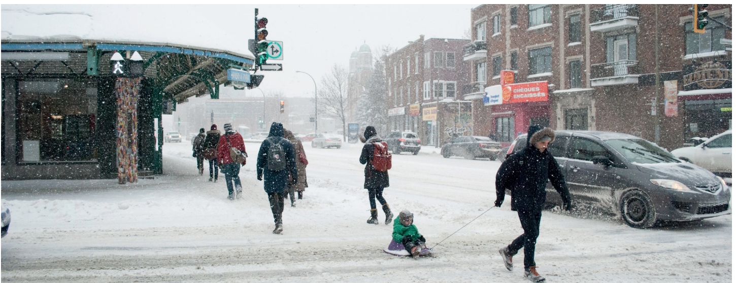
Intersection of St. Hubert and Jean Talon Street, Montréal, 2016

Wish your municipality would do more to maintain pedestrian infrastructure in winter? Report a fall, accident or improper management, or, submit this information to your elected officials. Find more resources on www.pietons.quebec and connect with the engaged Pedestrians community on Facebook!